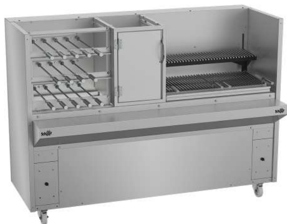
EXAMPLE PHOTO: 2,20m WIDE SUPER 380S WITH 14 SKEWERS WITH 3 GALLERIES, FIRE LIGHTER AND MANUAL LIFT GRILL.

SCHEER CHURRASQUEIRAS RUA ROQUE CALLEGE, 133 | CEP 95041-440 | UNIVERSITÁRIO | CAXIAS DO SUL | RS | BRAZIL